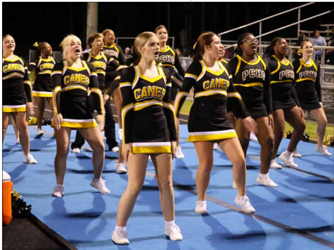
The always awesome Hurricane cheerleaders