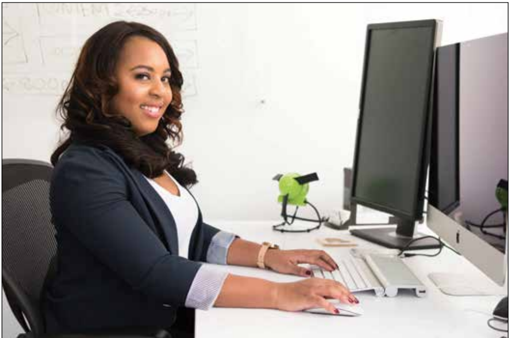
Electronic Health Records Online! Starting Sept. 8!