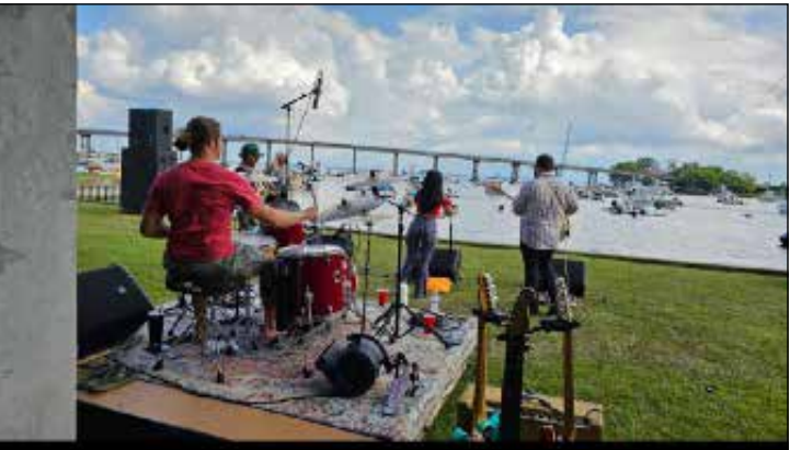
Bridge Atlantic played to a floating room only crowd.

This project is supported by the North Carolina Arts Council, a division of the Department of Natural and Cultural Resources.