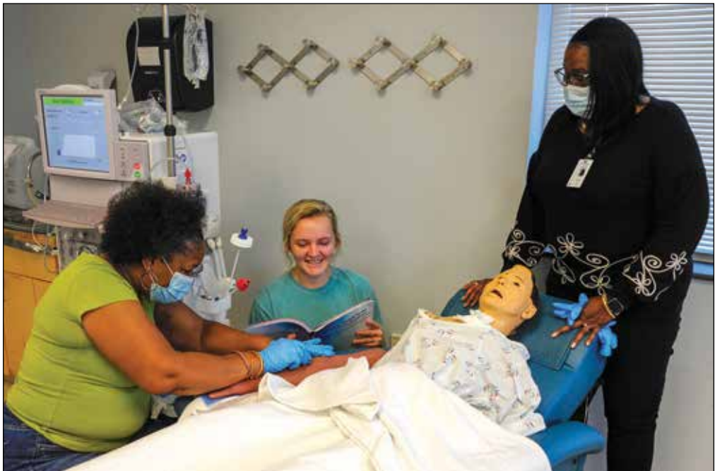
Dialysis Technician Course begins Sept. 8!