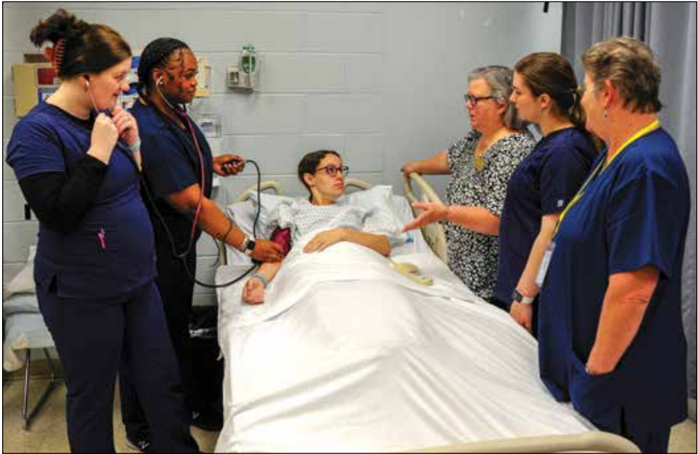
Nurse Aide I Hybrid! Register now!