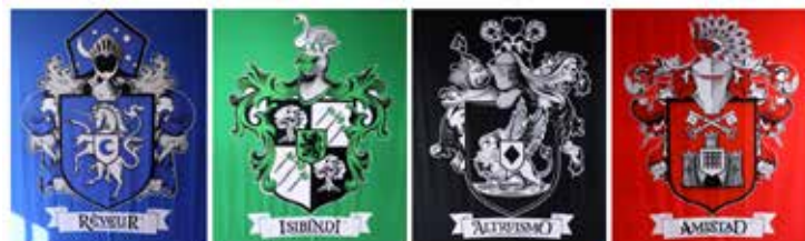
The four “houses” of Arapahoe Charter School.

of students from each grade level assigned to each of the four houses. The houses, Reuver, Isibindi, Amistad, and Altruismo have their own color, blue, green, red, and black respectively, and their own coat of arms. Four groups that are still united as Arapahoe Charter School.