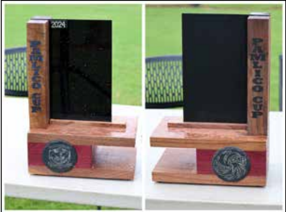
The Pamlico Cup Trophy features the logo of PCA on one side and PCHS on the other with an area to record each year that particular team wins the cup.

Soccer is taking off in Pamlico County and a good sign is that two schools from the county squared off on the pitch last week in competition for the Pamlico Cup. What is The Pamlico Cup you ask? It is much like the World Cup if the world is Pamlico County but without hundreds of millions of soccer fans watching worldwide on TV. The Pamlico Cup is pretty special around here if you play soccer for Pamlico County High School (PCHS) and Pamlico Christian Academy (PCA). It is a way to stir up some interest and create a friendly rivalry between the two County schools. The Mariners and the Hurricanes played round one for the cup last Wednesday at Lawson Creek Park in New Bern. The first half belonged to PCA, as by intermission the Mariners had built up a 7-1 advantage. In the second half both teams settled in and played some tough defense, with PCA finally winning round one by a final score of 9-2. These two teams will battle it out again in round two on August 28 on PCHS's home field. If PCA wins, they claim the trophy for 2025 outright. If PCHS turns the tables, they force a tie and the winner of the trophy will be decided by penalty kicks. The beautiful Pamlico Cup Trophy was made by Mr. Slate Laser Works in New Bern. Check out his awesome work at www.shopmrslate.com .