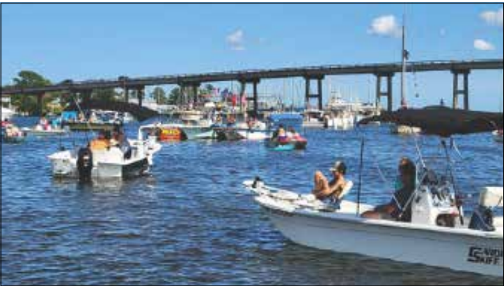
Pirate Jam attendees enjoying the tunes and beautiful afternoon.

Arrr, Matey! – One of the most iconic phrases associated with pirates is the hearty “Arrr, matey!” This classic pirate expression is a must-have in your vocabulary if you want to sound like a true seafaring scallywag. Practice rolling your ‘r’s and adding a gruff tone to your voice for extra authenticity.