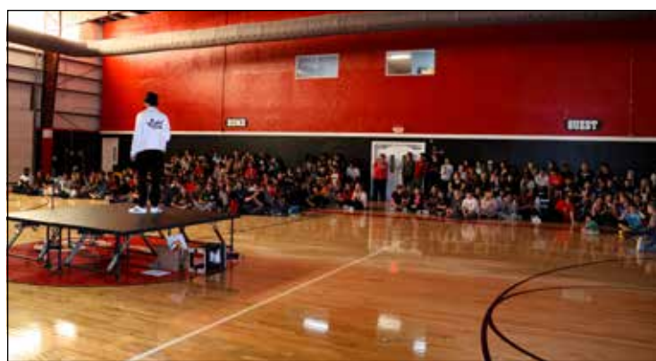
The entire school assembled in the gym for an exciting sorting day