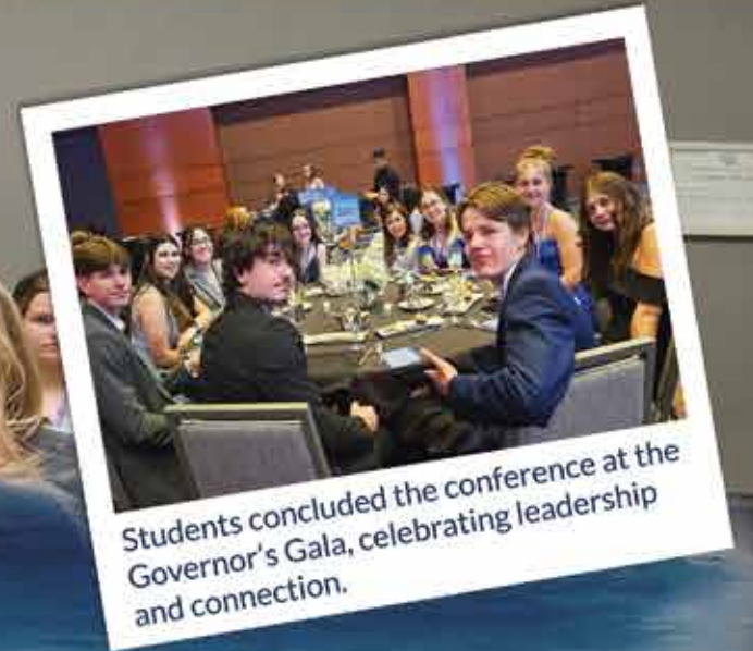
Students concluded the conference at the Governor's Gala, celebrating leadership and connection.

At the North Carolina Youth & Government Conference, PCA students drafted, defended, and advanced legislation on Raleigh's Legislative floor.