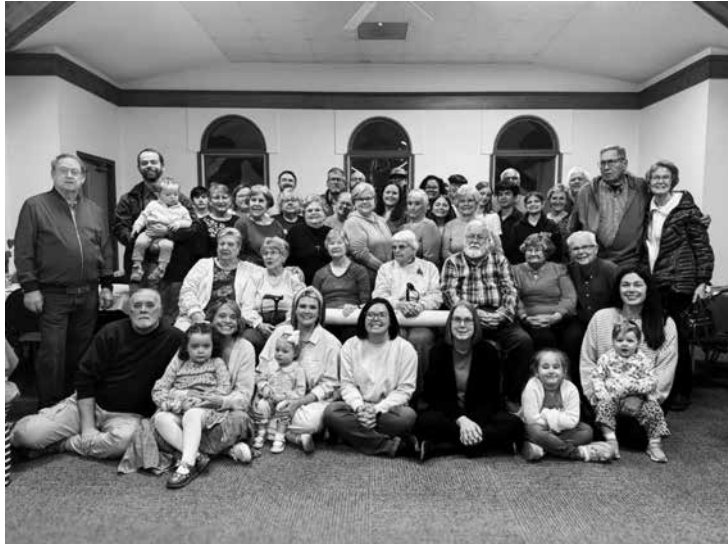
Stonewall Methodist Church gathered for supper cooked by the men and stuffed the 2050 time capsule.

Have a blessed week. Empty? Take Spiritual Vitamin E. "Enter into his gates with thanksgiving, and into his courts with praise: be thankful unto him and bless his name." (Psalms 100:4)