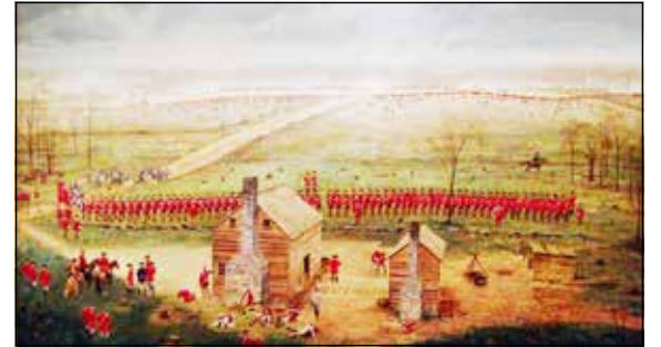
Battle of Guilford Courthouse on 15th March 1781 in the American Revolutionary War

March 17th, 1776 – After being under siege by the Continental Army, the British and their loyalist allies are forced to evacuate Boston and sail to Nova Scotia.