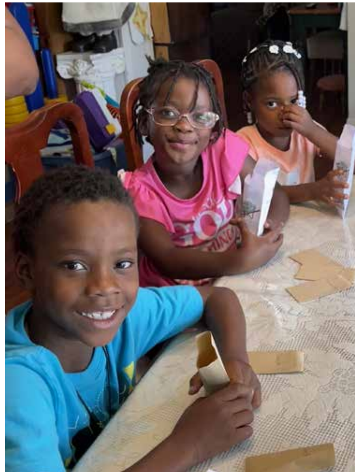
There are so many exciting things happening in Vandemere. To learn more about our projects and upcoming events, visit www.vandemerenc.com and see what our wonderful town is all about.

5:00 p.m. to 8:00 p.m. at Squidders Bait and Tackle. They will have hot dogs, chili, fixings, and more. Please come out to support the cause.